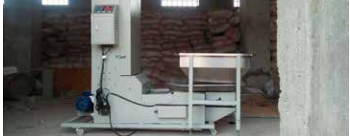
Machinery being assembled at our warehouse in Pakistan