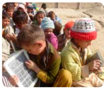
Support Hidaya Schools

Car Program: Received 22 vehicles as donations and gave them away to families and individuals in need in the SF Bay Area, where Hidaya is headquartered •