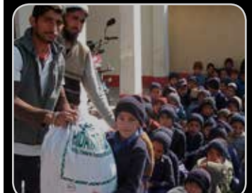
Container Shipment for In-Kind Donations