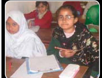
Support Hidaya Schools