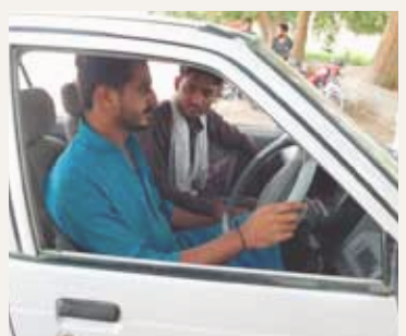
Job Skills Training