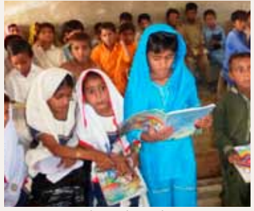
No Orphan without Education