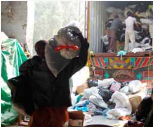
Unloading donations at our warehouse in Pakistan

It costs approximately $4,000 - $5,000 to ship each container (approx. $2,000 - $2,500 for shipping from US to Pakistan, approx. $1,000 for trucking in US & Pakistan, approx. $1,000 - $1,500 for clearing from port & Distribution in Pakistan). One container is enough to clothe over 10,000 people, please donate towards Container Shipment Project for In-Kind Donations. ♦