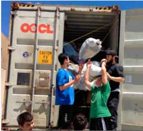
Loading donations at our warehouse in USA

Alhamdulillah, since 1999, Hidaya has sent over 200 forty ft. containers to benefit hundreds of thousands of people, mostly in Pakistan.