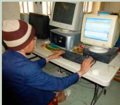
Student learning in Basic Computer Skills class

In addition to teaching students, a core group of HIST engineers are working towards strengthening Hidaya's over-all infrastructure by implementing "Hidaya Paperless System." This paperless system is meant to automate the entire work flow, allowing Hidaya's management to run its charitable programs and projects in an efficient manner and to scale these existing projects to other localities, insha'Allah. As part of this initiative, "Donation Tracking System" is now functional and provides the capability to automatically track specific donations like Qurbani, Sadaqah in the form of Sacrifice, Aqiqah, and Water Hand Pump, as well as send donors who donate online an email notification as soon as their requests are completed. Alhamdulillah, it is one of the Blessings of Allah that through HIST, Hidaya is able to upgrade and continuously improve our infrastructure.