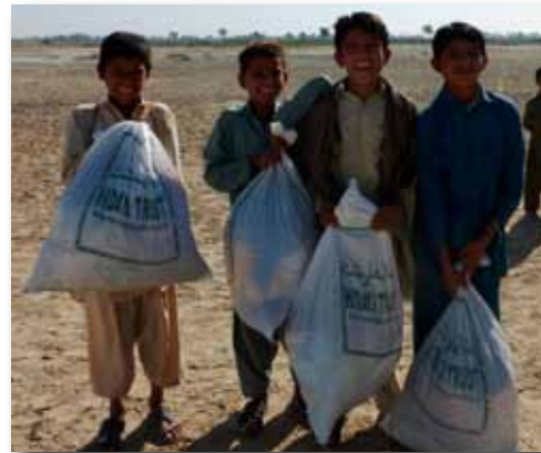
Some recipients of clothing packages