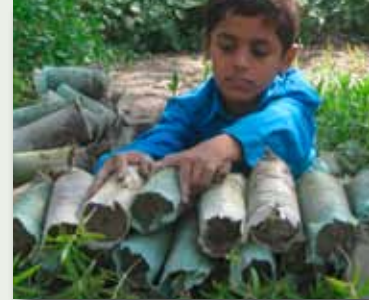
One Million Trees