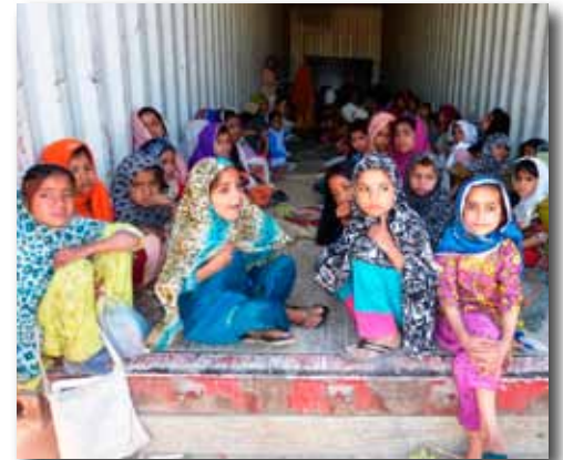
A container being used as a classroom

If you would like to put on a collection drive in your community, please contact our office at (408) 244-3282.