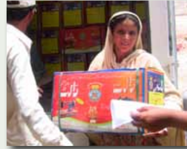
Small Businesses for the Poor