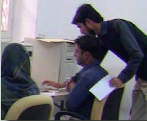
Teacher helping student in Software Development class

One of Hidaya's most unique initiatives is our Information and Communications Technology Program. Being headquartered in the Silicon Valley, the world's epicenter for technology, allows us to take the mindset of our volunteers and employees who have years of experience and background in this environment and pass it on to the less fortunate in under developed areas of the world.