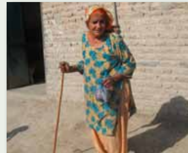
Sadaqah in the form of Sacrifice