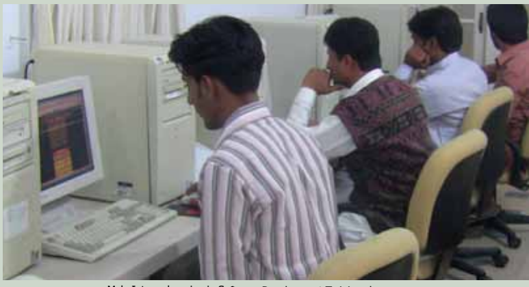
Male Interns learning in Software Development Training class at HIST

Hidaya's Information & Communication Technology Program includes the following projects, each of which is a class for intern students: Basic Computer Skills, Software Development Training, System Administration Training, Network Administration Training. HIST has the capacity to train 140 interns every 4 months in Sofware Dev. Training, and 40 interns every 2 months in System Administration & Network Administration.