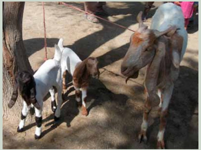
Goats given to a family for Animal Farming Project

Hidaya Foundation strongly believes that it is much better to help people become financially independent and self sufficient, rather than just providing them constant assistance. With this in mind, Hidaya expanded its Self Employment Project which was formerly under the Social Welfare Program, and made it into its own program to give it the importance deserved in hopes to raise awareness of this great need in the developing world. Under our Self Employment Program we currently have the following projects to help families get out of the cycle of poverty and stand on their own feet: