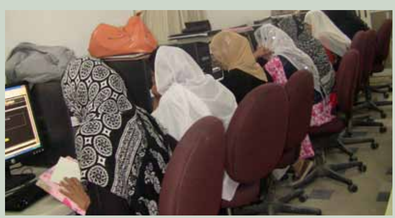
Female Interns learning in Software Development Training class at HIST