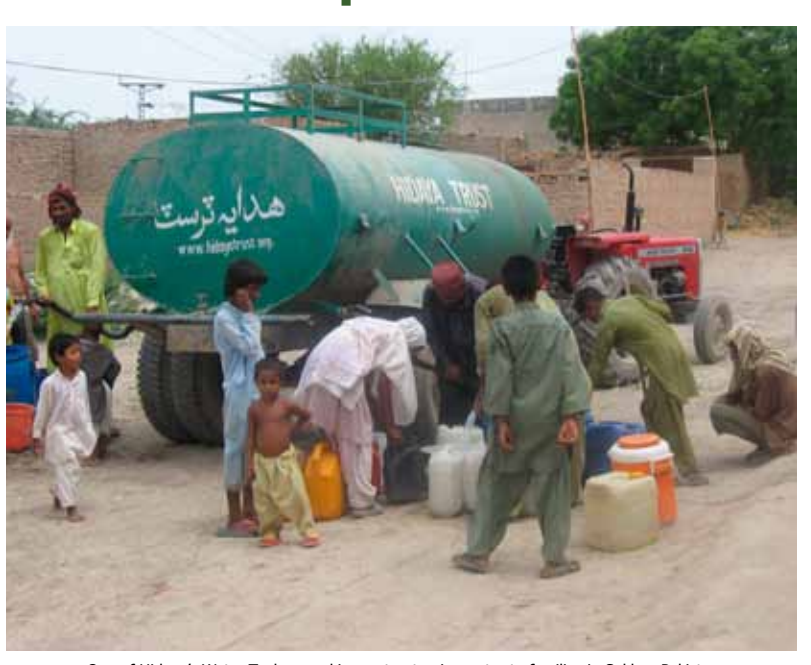
One of Hidaya's Water Tankers making a stop to give water to families in Sukkur, Pakistan

So far in 2011, a total of 325 Water Hand Pumps have been installed, and around 3 million liters of water have been distributed via water tanker.