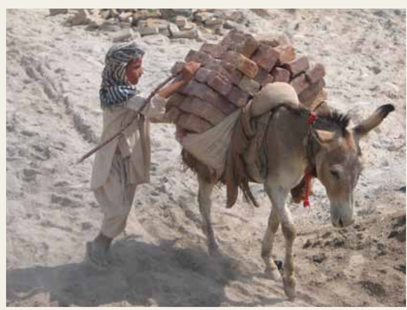
Countless poor children such as this one miss out on receiving an education to work long strenuous days to earn meager wages for their families and caretakers.