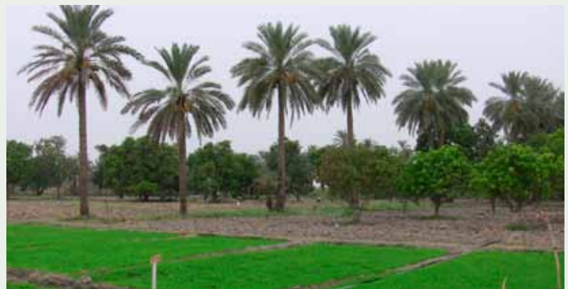
Hidaya's rice crops, date palms, and mango trees which are managed by HIFA students

One specific example of this is a pilot project we are currently working on, with a group of 15 youth between the ages of 18 - 25 from various small villages throughout Pakistan. What these 15 youth have in common is that all of them were forced to drop out of primary school due to poverty, and are now struggling to make a