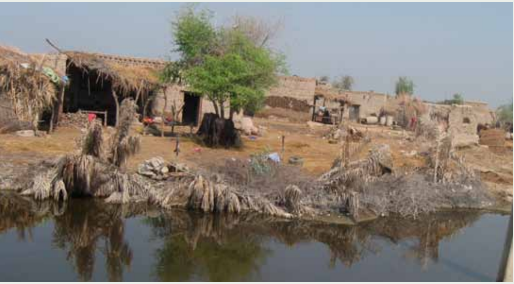
A poor village is visited and investigated by Hidaya's team under the one village at a time methodology

Alhamdulillah, as Hidaya's infrastructure has grown, we have been able to implement a "One Village at a Time" infrastructure, which is more of a push method. Now our team members go to impoverished villages and visit each family to understand their needs and the needs of the village as a