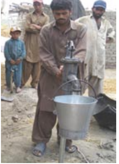
Water Hand Pump Installed in a Village