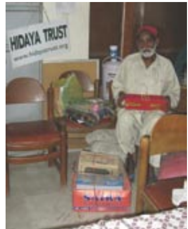
Gift Package Received by a Father for his Daughter's Marriage

In 2007, Hidaya helped 278 poor girls to get married. In 2008, we have already helped 242 girls to-date.