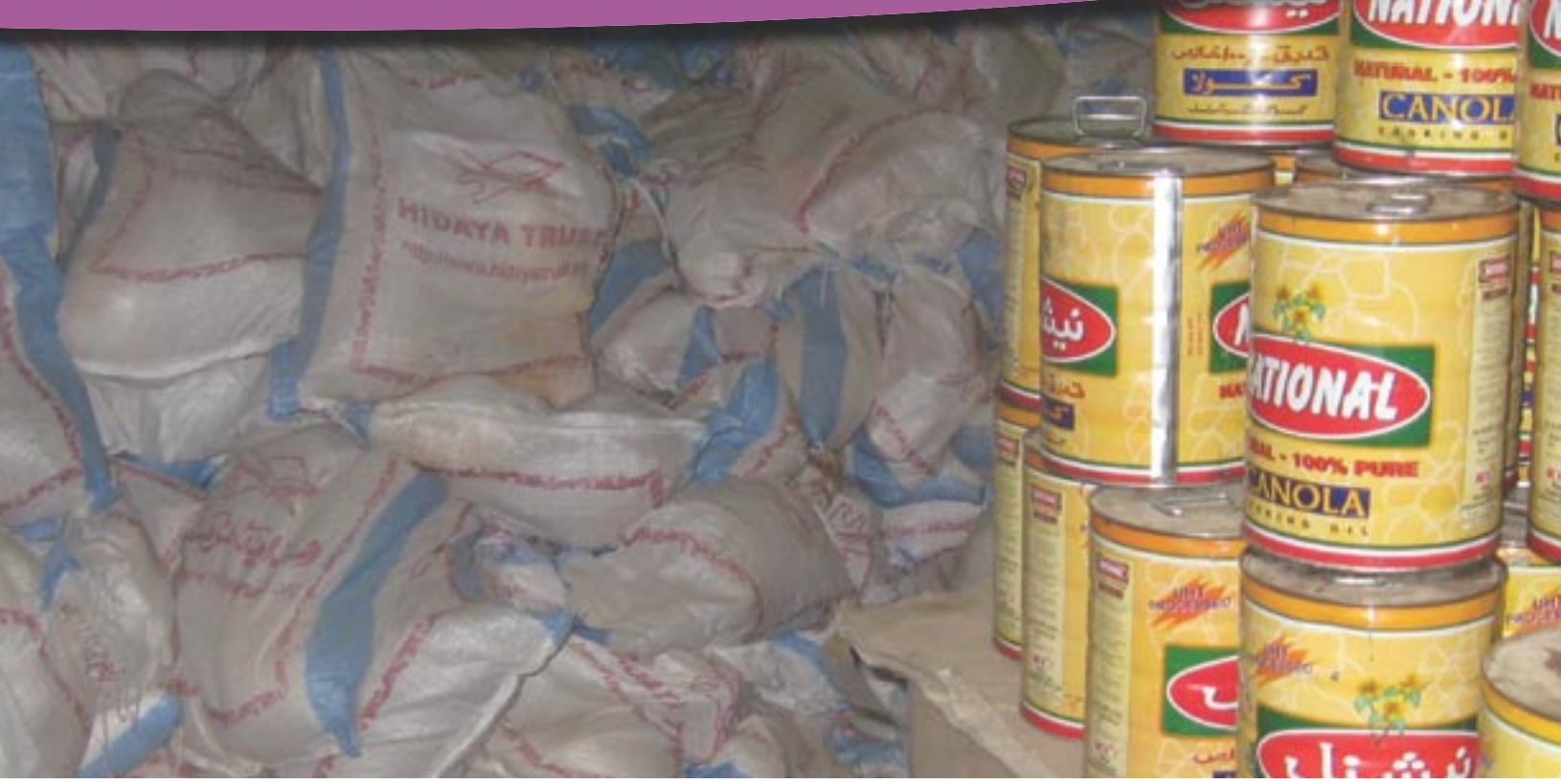
Dry Ration Packages for One Million Meals Project Ready for Distribution