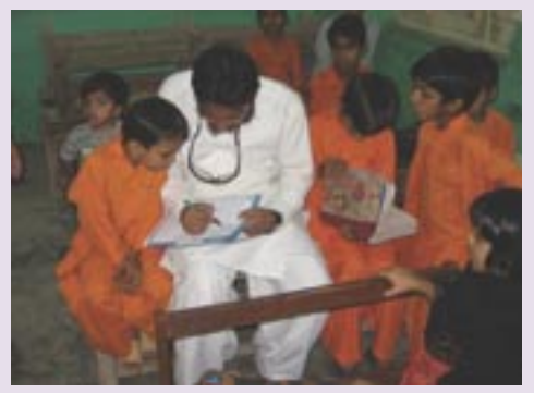
Hidaya Team Member Monitoring Orphans in Class

progress in school is a key process under this project. Hidaya team members assigned to each child meet regularly with teachers, school officials and guardians to ensure that they do not fall behind in studies. To further help students excel, Hidaya offers after-school programs to provide hands-on training in basic computer skills. To date, 10% of the supported orphans have undergone this innovative technology training program.