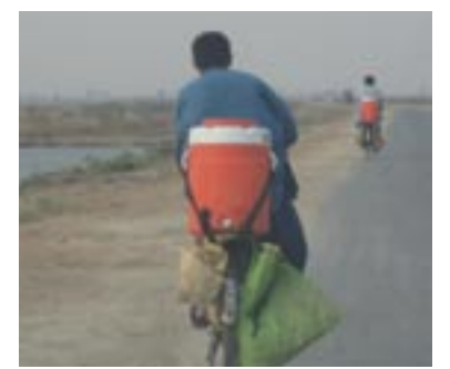
In Shahdakot, People Travel from Miles Away to get Potable Water