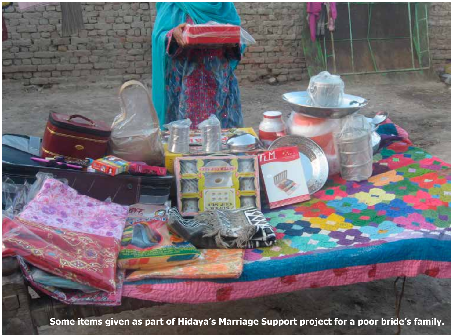
Some items given as part of Hidaya's Marriage Support project for a poor bride's family.

Hidaya Foundation supports poor families in South Asia who can not afford to get their daughters or sisters married due to poverty. Parents in these difficult situations are provided financial assistance to offset marriage expenses along with basic items necessary for a newlywed bride including dresses, shoes, utensils, bedding, fan, sewing machine, etc. Depending on the region, it costs approximately $200 to $300 to support the marriage of one young woman. To date, Hidaya Foundation has helped support over 1,700 marriages. Please donate to help the poor get married, and may Allah help you.