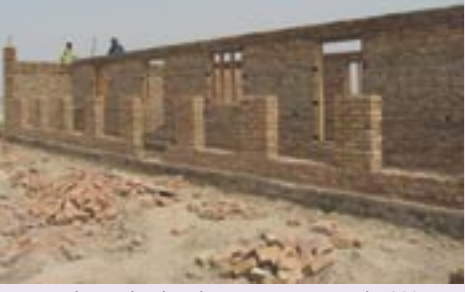
A Hidaya school under construction - July, 2007

Hidaya took a survey of schools in Pakistan's Sindh Province which produced shocking results. The data showed that over 50% of the rural public schools had been closed in some districts, many of which are actually listed as active schools which should