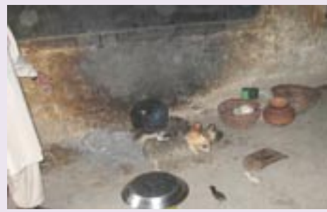
Cooking takes place under the blackboard at a ghost school used as living quarters for a family

for purposes other than educating children.