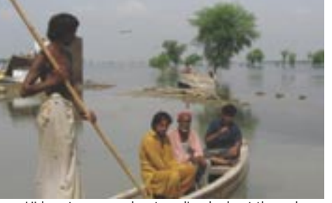
Hidaya team member traveling by boat through Shahdad Kot to register families for aid