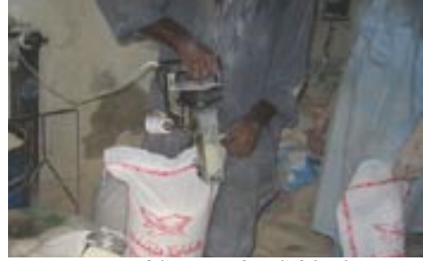
Preparation of dry rations for relief distribution

family received proper aid and can be given future assistance down the road. The beneficiary families, including weak and handicapped elderly, women and children, very much appreciated this