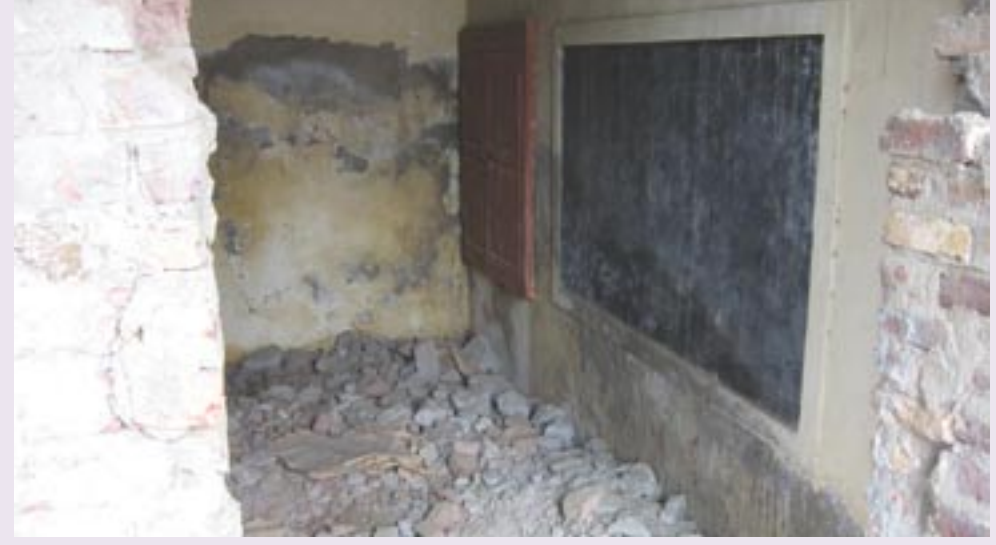
Classrooms have been looted and abandoned to the extent that even doorways have been taken

For long term rehabilitation, Hidaya is working towards rebuilding homes for the weakest people in these areas. It costs approximately $1,000 to construct a home with a small kitchen and bathroom made of cement blocks or bricks.