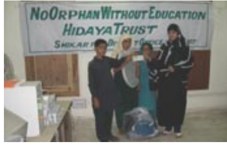
Orphans receiving assistance from Hidaya

rphans, the weakest of society, often suffer most because of lack of programs which address their needs and welfare. Countless orphans are very intelligent, but because of lack of financial support, they are unable to develop and utilize their skills and talents through education. Hidaya Foundation reaches out to these orphaned children, making them feel that there are people in this world who love and care for them. It costs just $30 - $50 per month to support and educate an orphan. Hidaya is currently supporting over 650 orphans monthly, and over 2,500 orphans are helped a few times throughout the year.