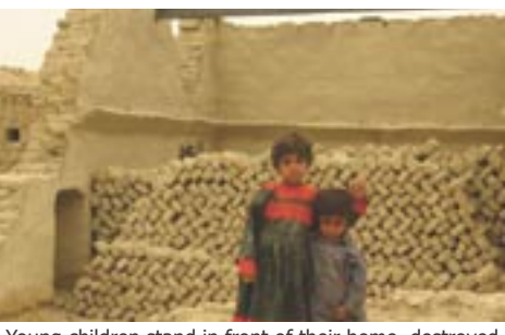
Young children stand in front of their home, destroyed by floods in Kharan

Range and flooded many villages in Shahdad Kot and Dadu Districts. In Shahdad Kot, Hidaya's team again registered the affectees by filling out application forms for each family, and issuing them tokens which were exchanged for relief supplies. Because of the intense heat of over 115°F, Hidaya team members personally went to every family and handed them their