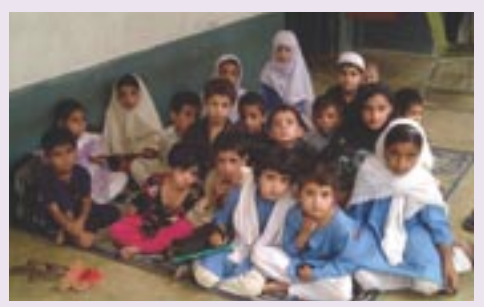
A few of the many young students whose lives have been touched by Hidaya

on this project, Hidaya's team understands that there are several