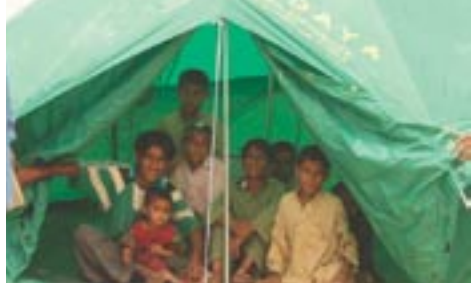
Balochi children take shelter inside a tent donated by Hidaya after their home was destroyed

Range and flooded many villages in Shahdad Kot and Dadu Districts. In Shahdad Kot, Hidaya's team again registered the affectees by filling out application forms for each family, and issuing them tokens which were exchanged for relief supplies. Because of the intense heat of over 115°F, Hidaya team members personally went to every family and handed them their